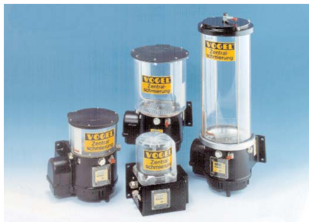
The new KFAS/KFGS generation of pumps with integrated control system. Rugged design together with the latest technology.