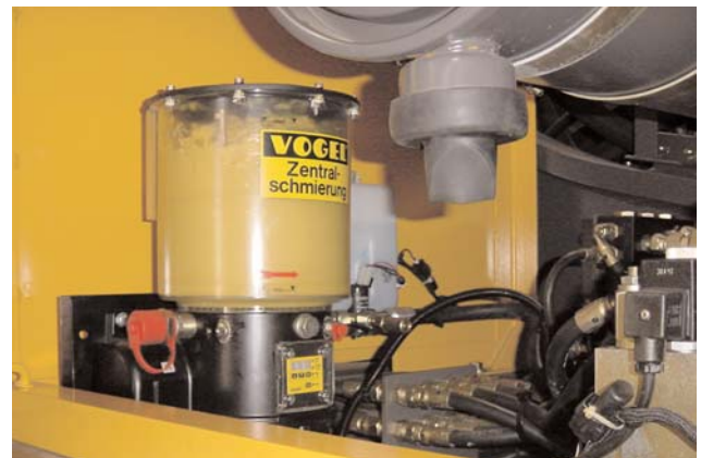
KFGS piston pump with 6 kg grease reservoir